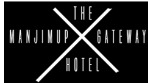
Manjimup Gateway Hotel