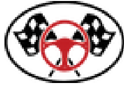
Manjimup Economy Auto Parts