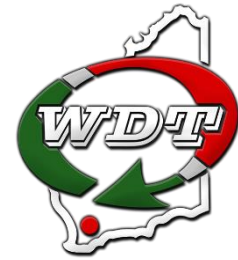
Warren District Transport